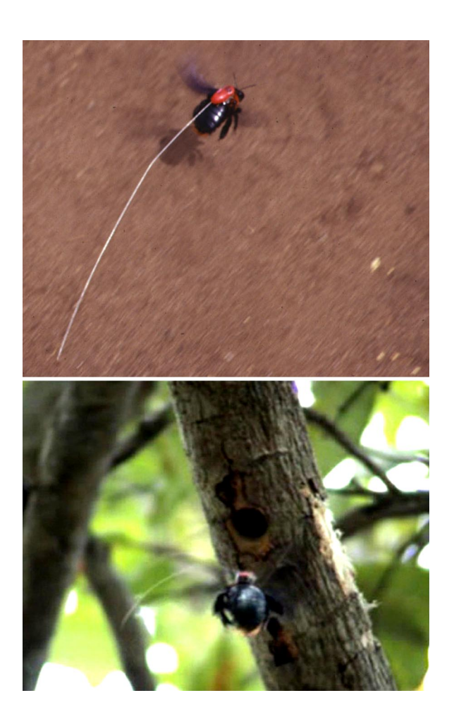
Fig. 3. Xylocopa flavorufa taking off (Upper) and returning to its nest (Lower).

If we consider the potential domesticated to wild cowpea gene flow, only one flight was between wild and domesticated cowpea (in the three recorded bouts, the field was the last place visited before returning to the nest). This ratio will increase slightly when wild plants are adjacent to domesticated cowpea fields, which is often the case in coastal Kenya. It should also increase much more in situations where wild cowpea plants are weeds